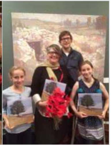
Above right: The ANZAC Tree book launch at QVMAG