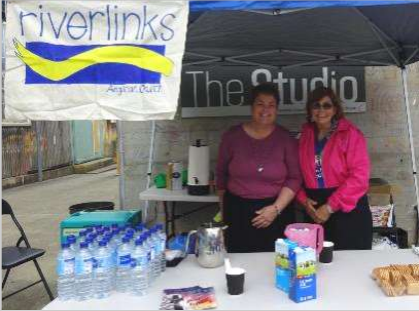
Riverlinks Café served free morning tea & water to keep the crowd hydrated for the entertainment!