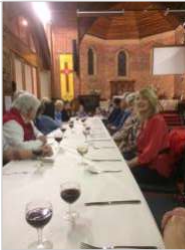
Above: Passover meal St A's

Newsletter deadline for photos, articles, etc. is 20 th of each month unless otherwise stated